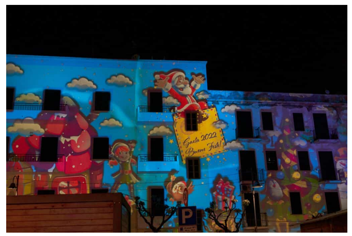
Christmas projection in Corso Cavour

In front of the Municipality you will find the traditional Christmas markets where you can buy souvenirs of the city, Christmas decorations and much more. How about a skate on the ice rink where you can turn back time and become a child again, or even take your first steps in ice skates?